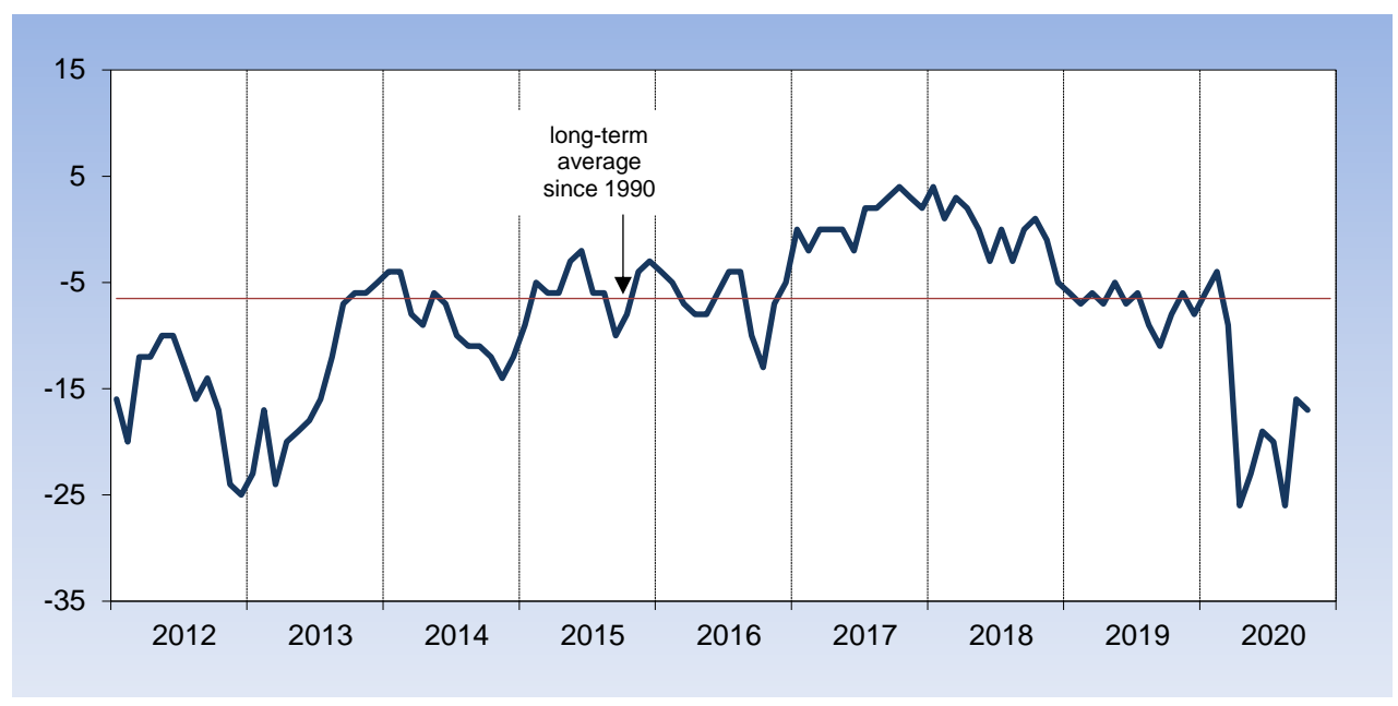
Expectations for the next twelve months